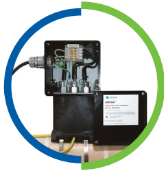
AMIGA Quick Connect

Innovative heating cable solutions from Drexan Energy Systems are changing how trace heating is designed and installed in the field providing significant cost-savings and outstanding reliability.